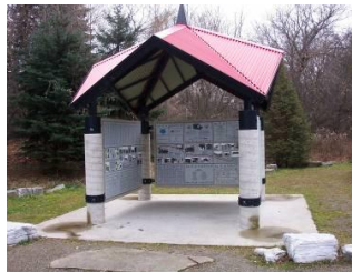
Trans Canada Trailway Pavilion Caledon East, Ontario

"Walk of Fame Nominations" Office of the Mayor, Town of Caledon 6311 Old Church Road Caledon East, ON L7C 1J6